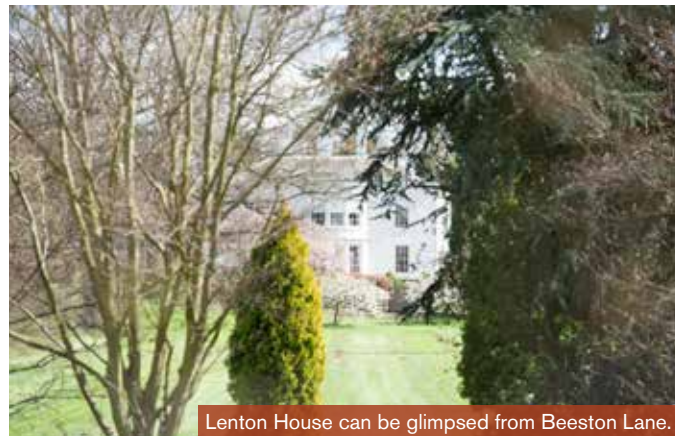
Lenton House can be glimpsed from Beeston Lane.