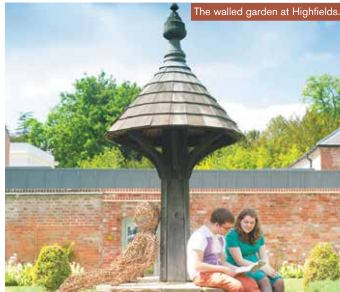
The walled garden at Highfields.

To the east side of the house is the walled garden. Edward Lowe, an astronomer, meteorologist and naturalist who lived at Highfields in the mid to late-19th century, filled the garden with vineries, stove houses and exotic ferns and plants.