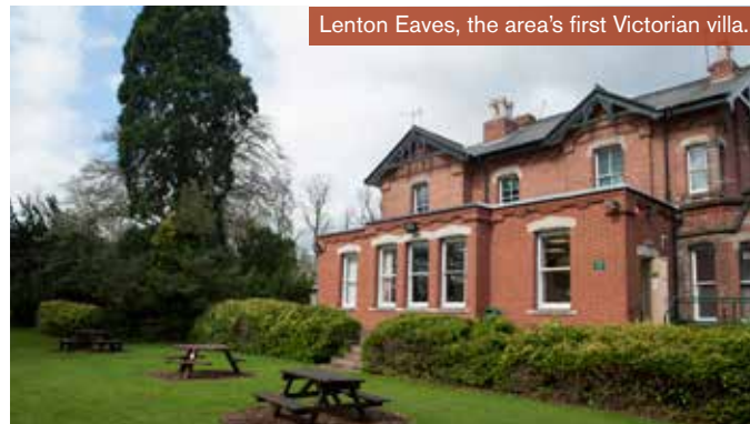
Lenton Eaves, the area's first Victorian villa.

Now the University Sports and Social Club, Lenton Eaves can be found where Beeston Lane bends to run parallel with Derby Road. Just after the bend a footpath marks the point where the two turnpikes joined.